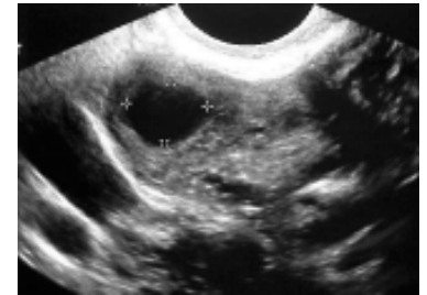
Endovaginal image of an ectopic tubal pregnancy. Note the thick adnexal ring which is distinct and separate from the ovary. This sign is highly accurate in the diagnosis of ectopic pregnancy.

Gynecologic ultrasound with high-resolution transabdominal and endovaginal scanning is a potentially life-saving diagnostic test performed at Everett Radia. Conditions such as ovarian neoplasia, benign adnexal cysts, endometrial disorders, uterine myomas and ectopic pregnancy are readily diagnosed with this test and with the salient clinical data.