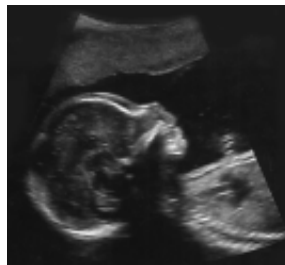
Facial profile of a 26-week fetus

In certain cases we do three-dimensional imaging, a technique that can help with the diagnosis and characterization of complex anomalies. A 3D picture also gives prospective parents a glimpse into the future.